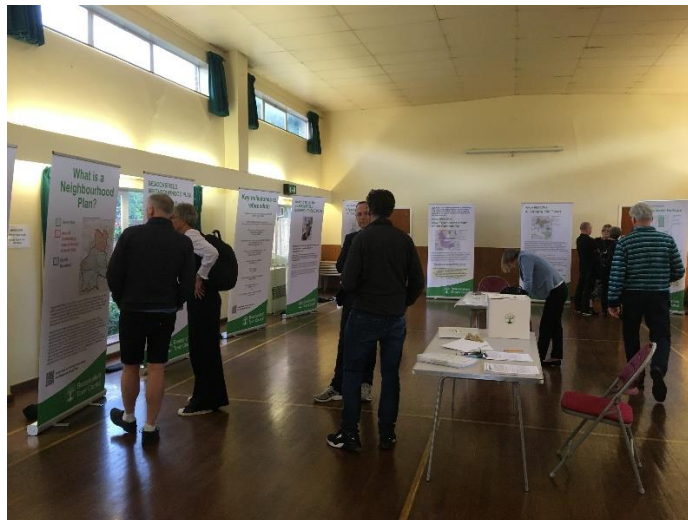
Public exhibition at St Thomas' Hall, Mayflower Way, Beaconsfield