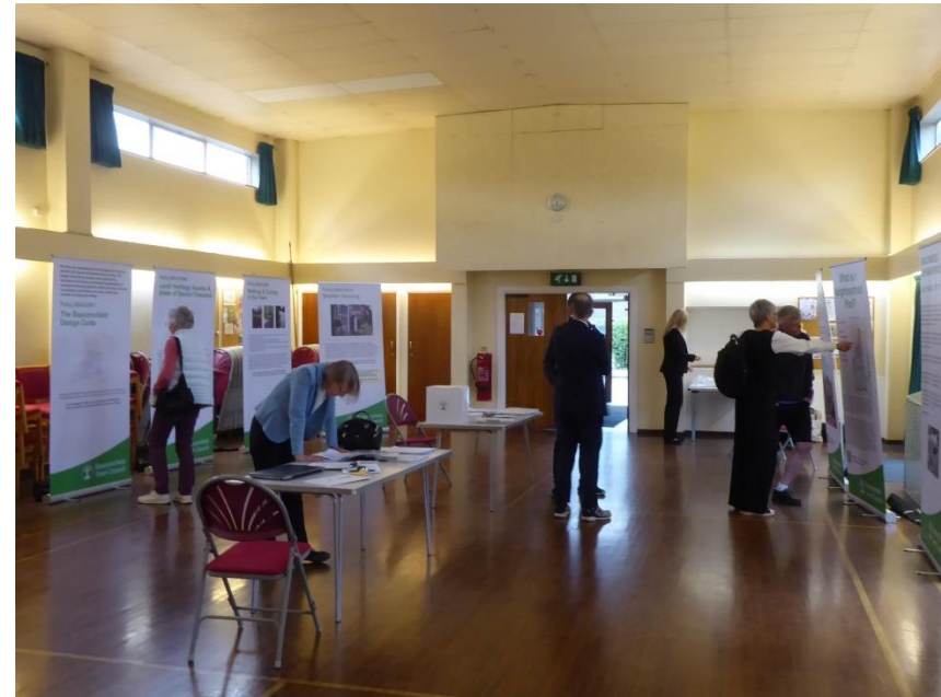
September 2022 exhibitions, Holtspur

This took place from 22-24 September 2022. This was timed to sit in the middle of the 6-week Reg14 consultation period, which started on the 5 September 2022. This was to enable residents to have viewed all the draft documents in advance of the exhibition if they wished. As previously these were manned exhibitions set up at local village halls across the town in all 3 hearts of Beaconsfield. This was an additional part of our Regulation 14 Consultation, with over 120 members of the public attending. The aim was to seek views from all stakeholders and in particular local views on our draft policies. To view exhibition display please click exhibition panels . This was also an opportunity for people to fill in a paper questionnaire, which were uploaded and added to the online survey.