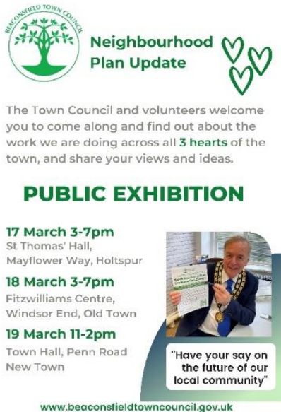
Poster of first set of exhibitions

Adverts, articles, posters, and questionnaires have been used extensively to promote the NP and gather local views throughout the NP project. This includes advertising to recruit members of the public onto the Steering Group and working groups of the NP. Also, how to find out more, promote exhibitions and fill in questionnaires including a video from the mayor inviting people to attend the public exhibitions which can be found on our website, see link.