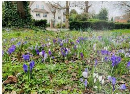
Thanks to Cllr Lorna Shaw

It's great to see the first signs of spring around the town and all the lovely bulbs planted by various community groups adding much needed colour.