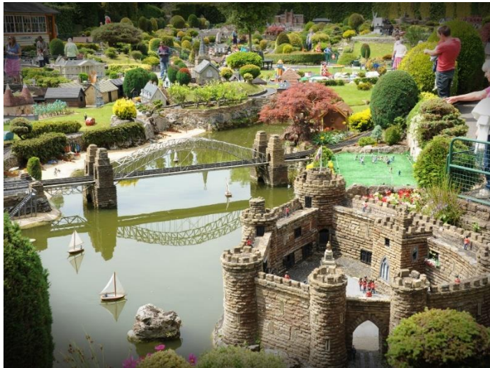
Bekonscot Model Village

It was suggested more reference within the document to Bekonscot and the National Film and Television School. This was considered and accepted and included in the submission document.