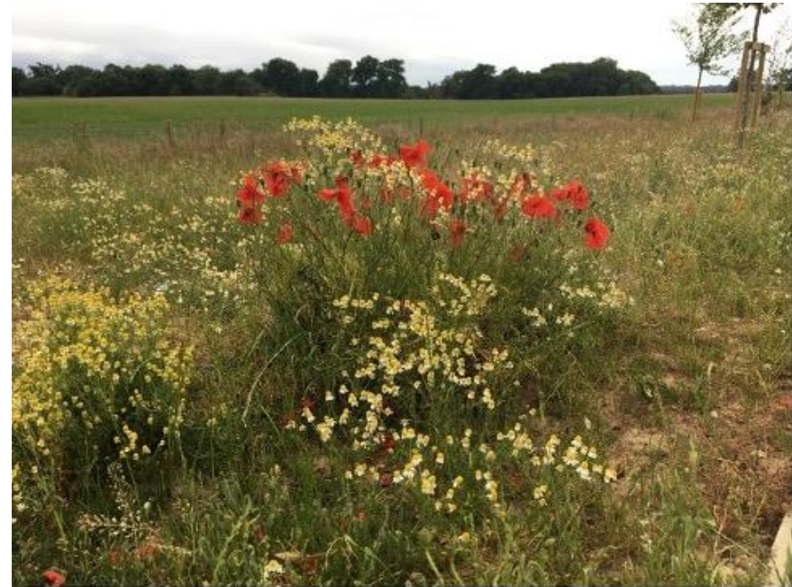
Green Belt on A355

and where appropriate strengthened throughout the submission document.