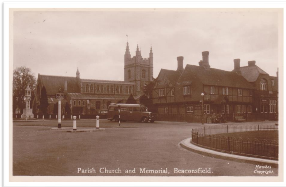
St Mary's Church, Windsor End

Landowners of Heritage Assets that were identified for inclusion in the NP heritage assets list were contacted by hand delivered letters to the properties in question or emailed informing owners of their identification in this NP, a copies of which can be found in the appendices.