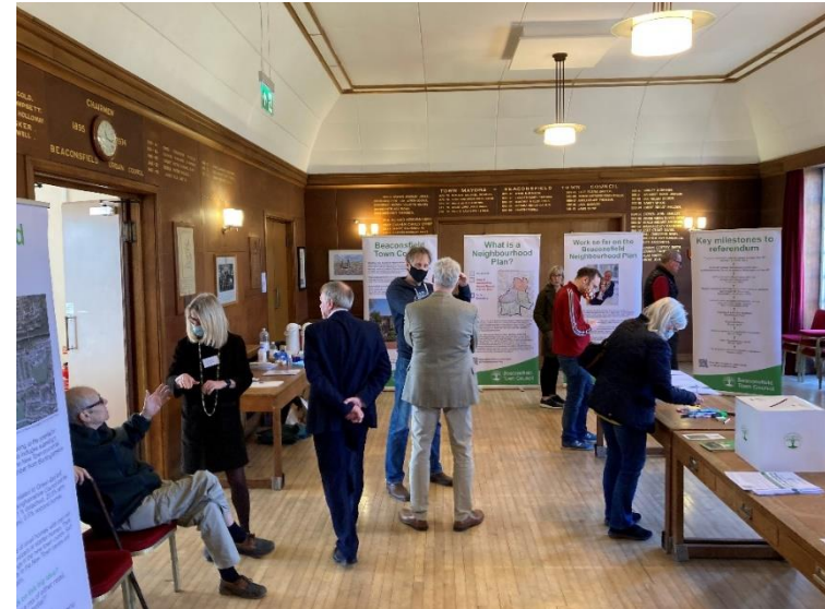
New Town exhibition March 2022

Exhibitions were promoted locally including via notice boards, social media, press releases, Beaconsfield Together magazine articles and/or leaflet drop, mailing lists.