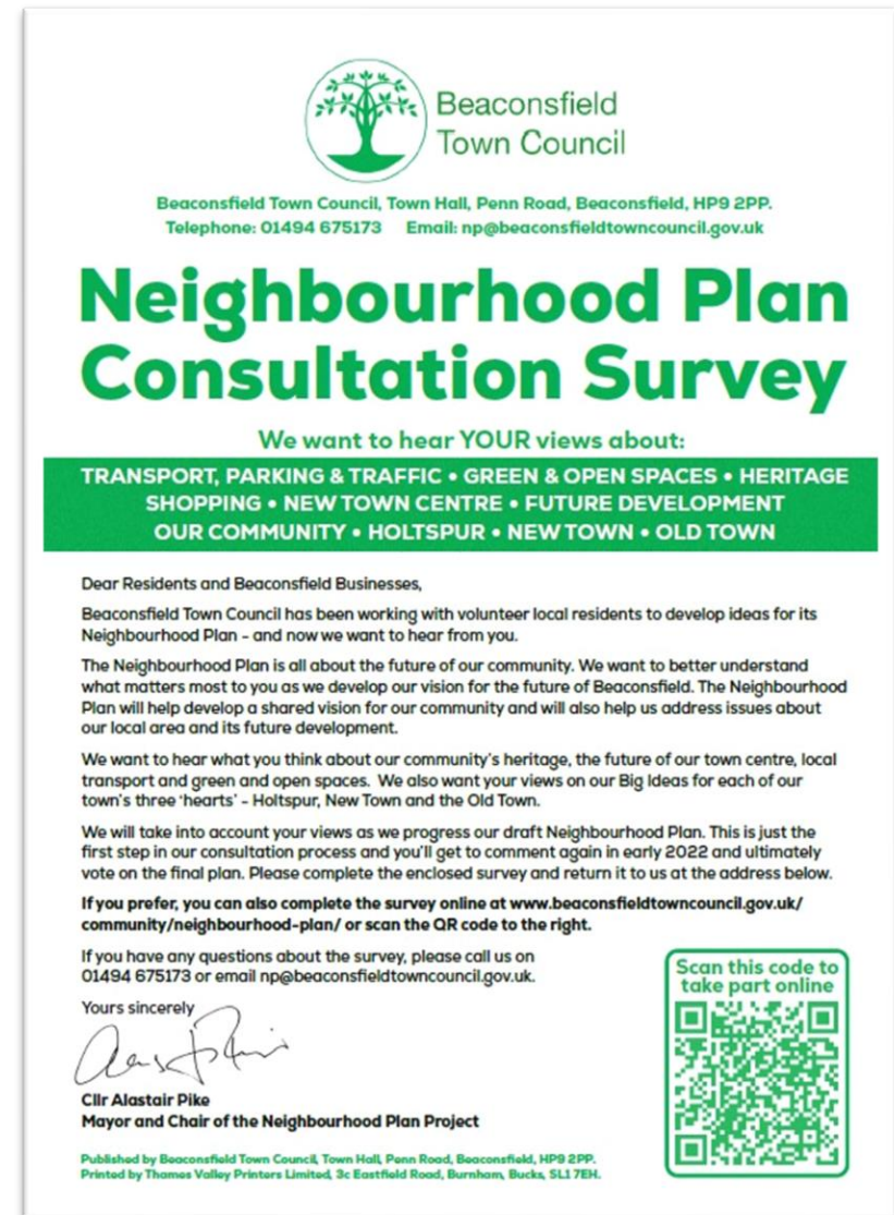
Paper version of Survey Questionnaire November 2021

Special survey response boxes were produced and placed in each of the commercial areas of the town, we refer to as the 3 Hearts, enabling residents to easily drop off their questionnaire without posting. Boxes were at Thirst4Coffee café at Holtspur, Jackson Howes Estate Agent in the Old Town, and the library and town hall in the New Town.