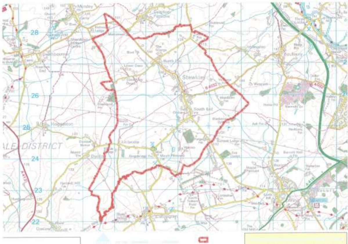
Figure A: Designated Neighbourhood Area

The purpose of the Strategic Environmental Assessment (SEA) is to provide an assessment of any significant environmental effects resulting from the policies and proposals of the Submission version of the Stewkley Parish Neighbourhood Plan in accordance with EU Directive 2001 / 42. Figure A below shows the designated Neighbourhood Area.