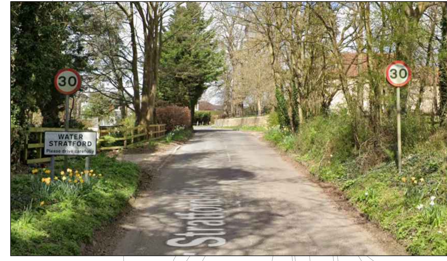
Ex. TS1, Ex. TS2 Existing signs to be retained.

This drawing is not to be used in whole or part other than for the intended purpose and project as defined on this drawing.