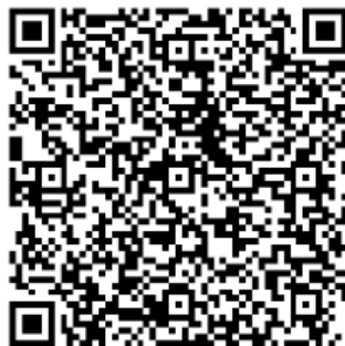
Consultation QR Code